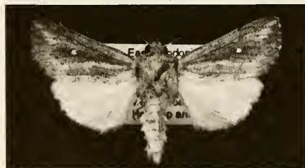
Fig. 18. Leucania punctosa , ♂ - Byalo Pole, 21.IX.1995.

62. One worn specimen, genitalia checked.